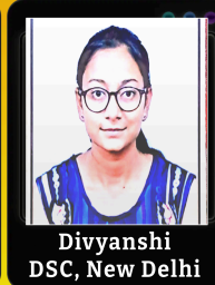
Divyanshi DSC, New Delhi